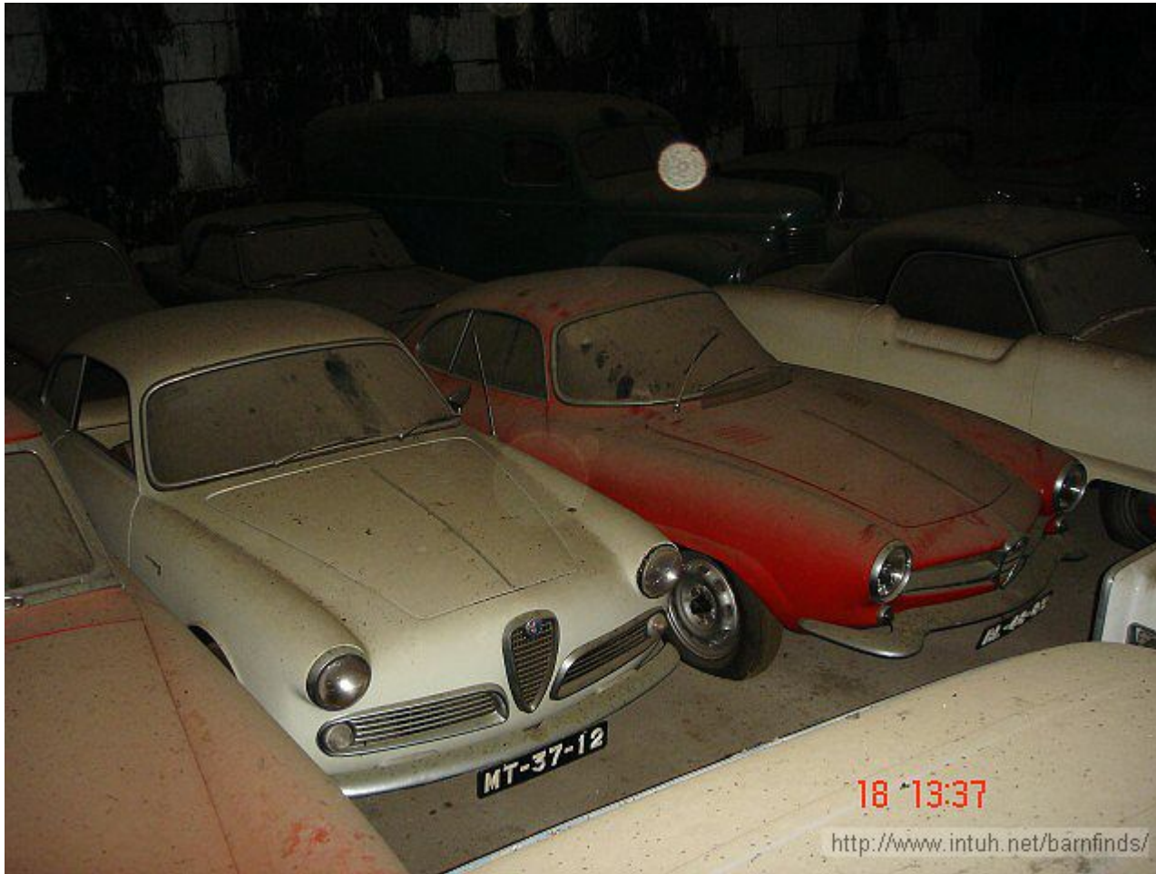
Giulietta Sprint, Giulia Sprint Speciale (SS), Nash Metropolitan.