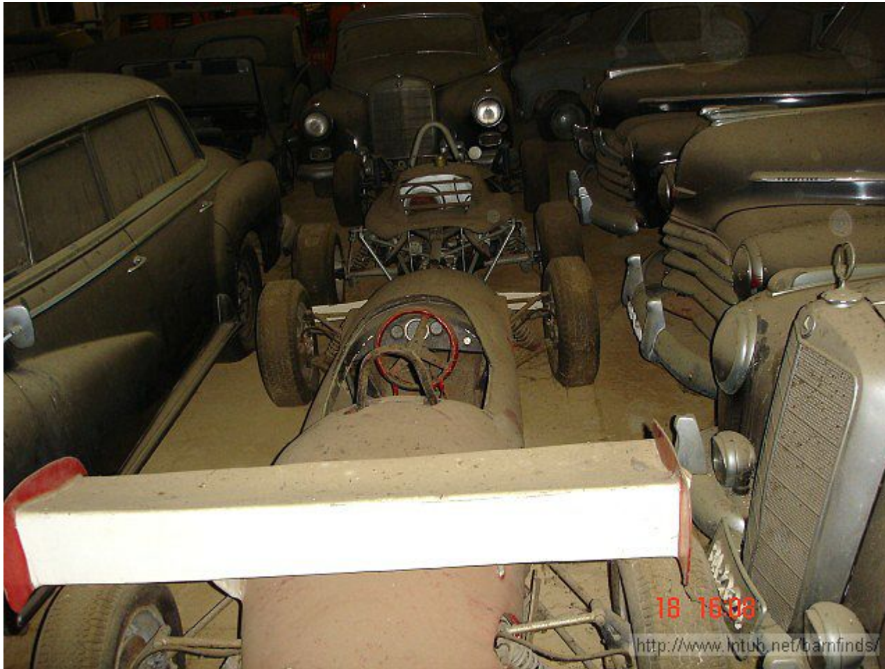
BMW V8, Formula racers, Chryslers, Mercedes, Austin A30.