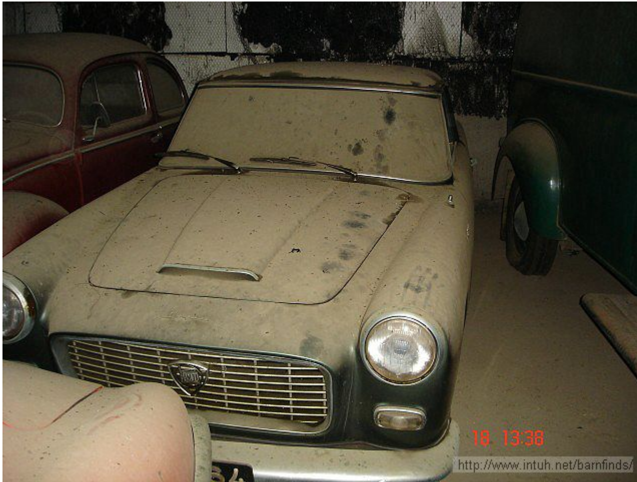
Lancia Flaminia Coupé.