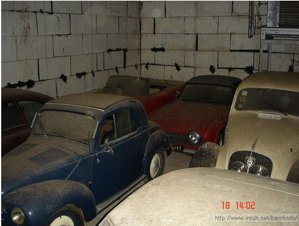
Fiat Topolino II, Triumph TR4, Peugeot 202.