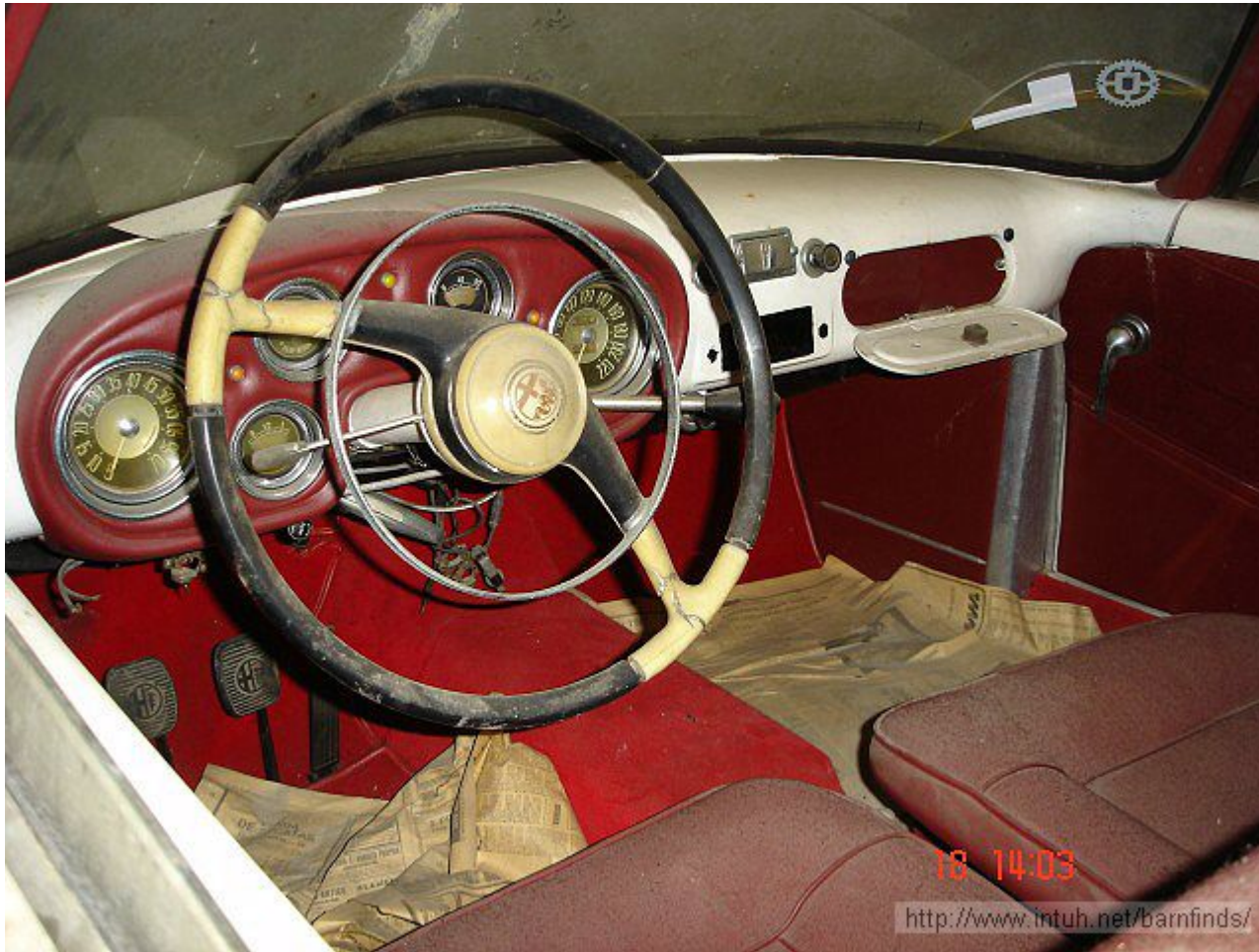
Interior of Alfa Romeo.