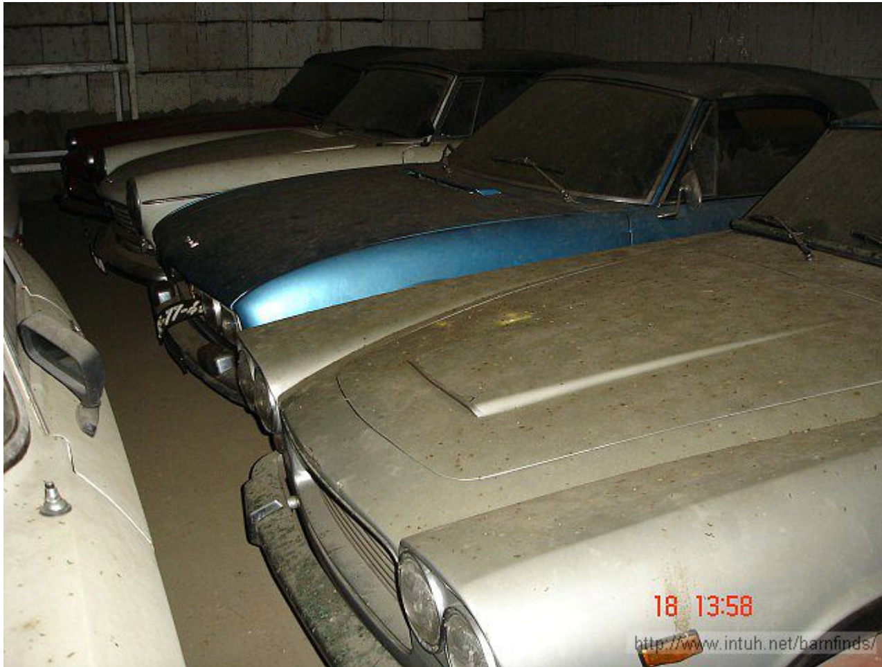
Lancia Flaminia Coupé, Peugeot 504 cabriolet & 404 cabriolet.