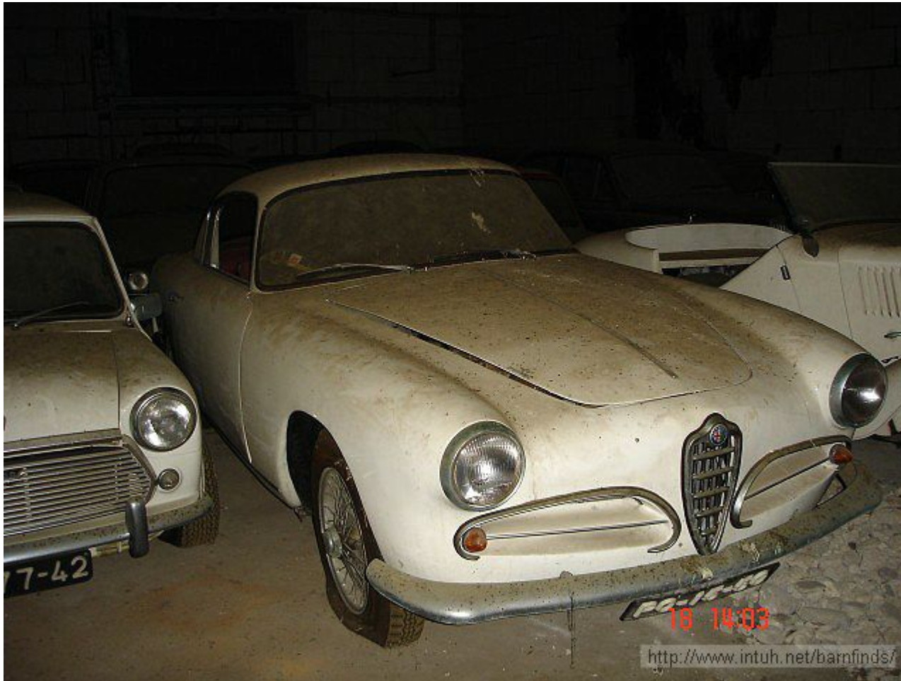
Mini, Alfa 1900 Super Sprint, Balilla.