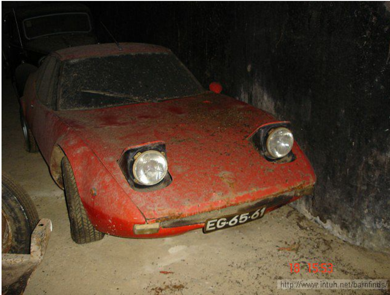
Abarth 1300 Scorpione.