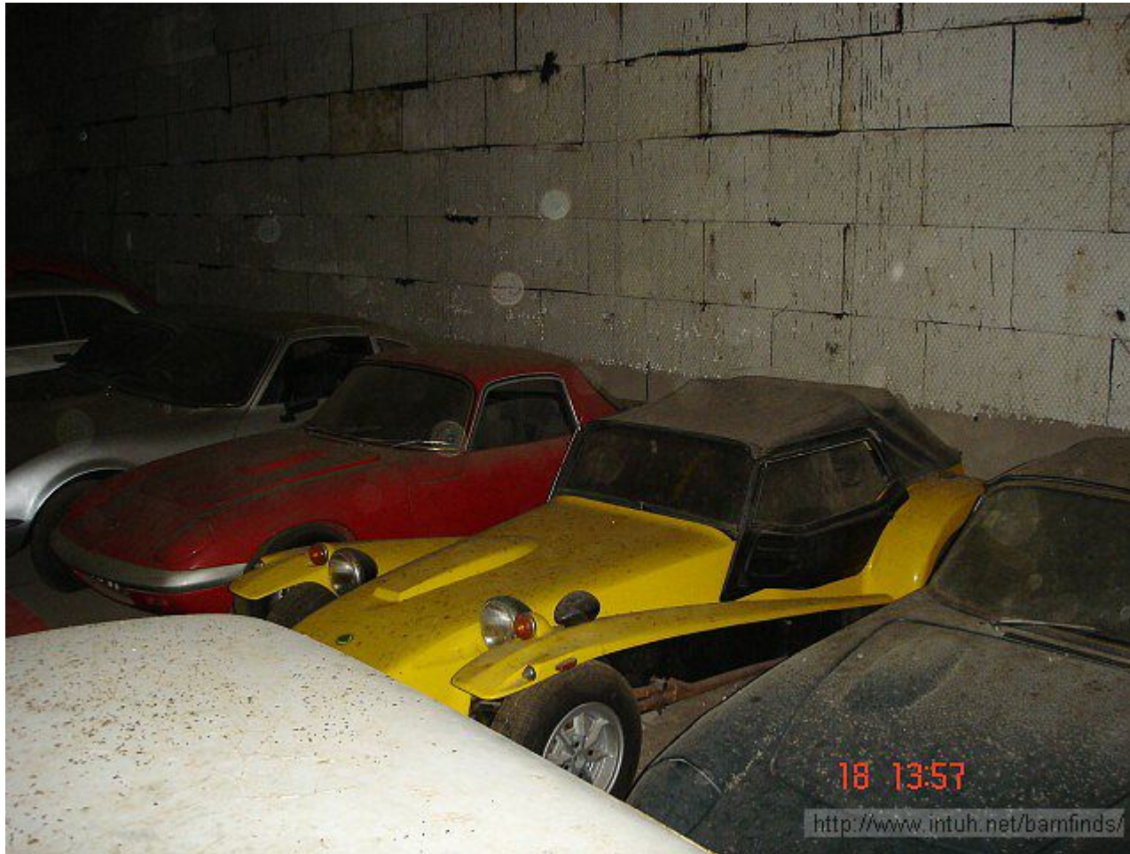
Opel GT, Lotus Elan FHC, Lotus Super Seven Series IV, Lotus Elan DHC.